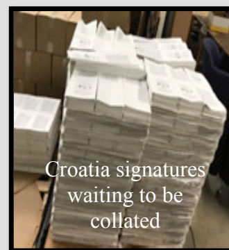
Croatia signatures waiting to be collated

Praise the Lord - the container headed to Croatia with over 170,000 John/Romans booklets was shipped mid-April! Thanks again to all of the churches and individuals that helped purchase rolls of paper, and that contributed funds for shipping, and to all of our volunteers who spent countless hours collating, stapling and trimming this project.