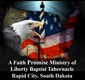
A Faith Promise Ministry of Liberty Baptist Tabernacle Rapid City, South Dakota

Printing and Shipping The Light at NO COST to Missionaries and Church Planters...Worldwide!