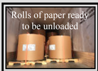
Rolls of paper ready to be unloaded

We received a truckload of 33 rolls of paper earlier this year, and this paper is paid in full! This load will cover most of our scheduled projects through 2018. Thanks for your financial support!