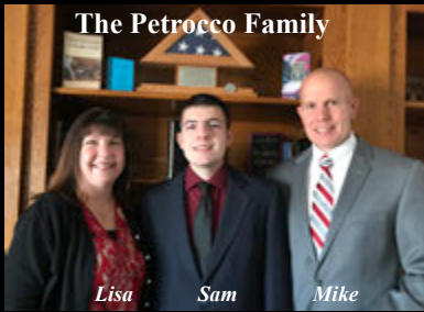
The Petrocco Family