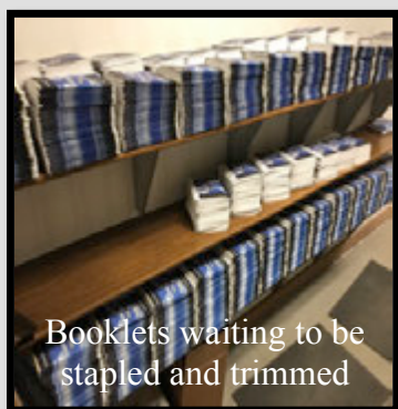
Booklets waiting to be stapled and trimmed

Praise the Lord - the container headed to Croatia with over 170,000 John/Romans booklets was shipped mid-April! Thanks again to all of the churches and individuals that helped purchase rolls of paper, and that contributed funds for shipping, and to all of our volunteers who spent countless hours collating, stapling and trimming this project.