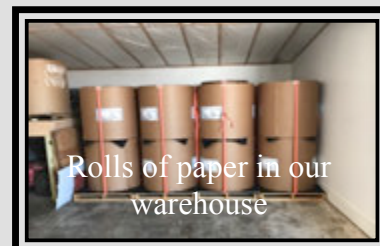
Rolls of paper in our warehouse

We received a truckload of 33 rolls of paper earlier this year, and this paper is paid in full! This load will cover most of our scheduled projects through 2018. Thanks for your financial support!